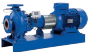
Etanorm with PumpMeter and IE3-motor